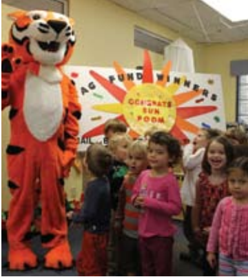
The Tesseract Tiger celebrating with the Sun Room

We want to offer a sincere and grateful thank you to all the parents who contributed to the Tiger Annual Fund this year. Your contributions totaled more than $180,000.