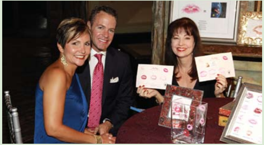
Fun with the fortune teller.