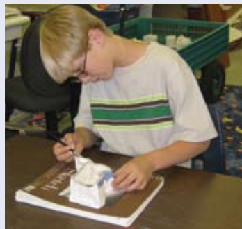
Lower school students enjoy working on their projects made with the school's new kiln.