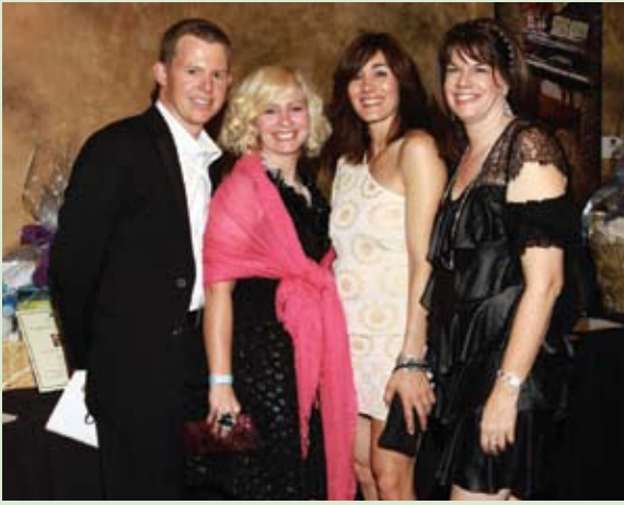
Enjoying the silent auction.