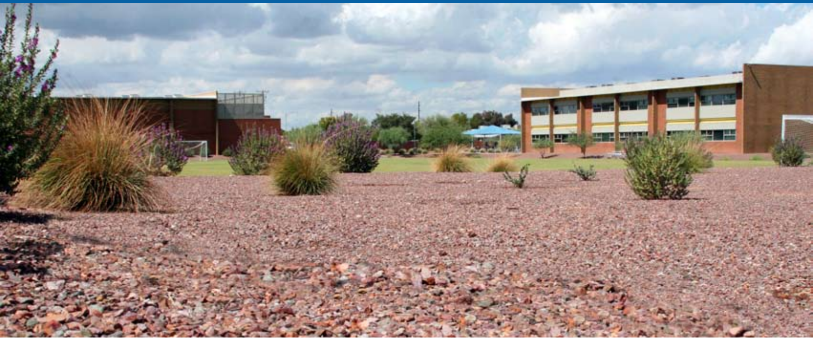
Tesseract Middle and Upper School Campus

Tesseract's growth over the last few years often comes up as a topic of conversation, even among the alumni. My youngest son attended Tesseract, joining the school when we moved to Arizona in August 2003, and leaving upon completion of eighth grade, one year before the new high school opened. Often his former classmates come to our home and reminisce, speaking fondly about their time at the Doubletree campus, which at that time housed the early childhood through eighth-grade students. They also share their admiration for the Shea campus—some of them wishing they could have enjoyed the new campus—and they are astonished at how quickly we have grown from 280 to 373 students.